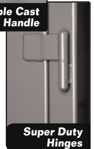
Super Duty Hinges

SXHDSC Series - Superior 12 gauge steel construction supports loads up to 2,000 lbs. per shelf, evenly distributed. Shelves adjust on 4" centers. Durable cast handle with padlock tab combined with locking rod assembly provides maximum security. Cabinet includes 6" legs. Constructed with super duty welded hinges. -D units include drawers. ■ Options: Extra shelves.