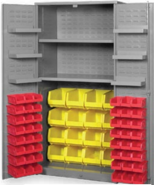
HDHC-3672-26-64 STYLE C