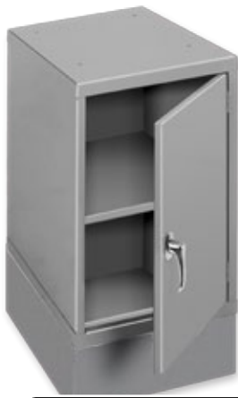
BC-1 & #6 Base