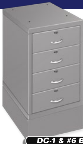
DC-1 & #6 Base