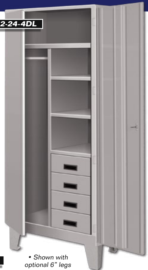
• Shown with optional 6" legs