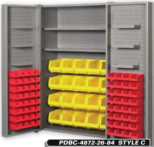
PDBC-4872-26-84 STYLE C