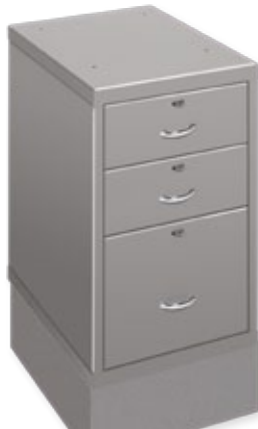
DCF-1 & #6 Base