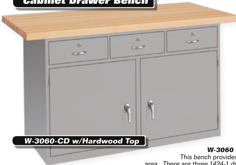
W-3060-CD w/Hardwood Top