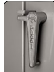
Durable Cast Handle