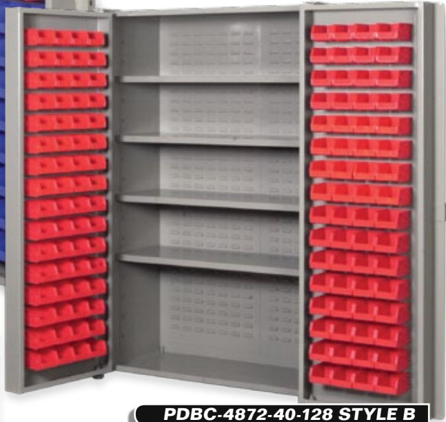
PDBC-4872-40-128 STYLE B