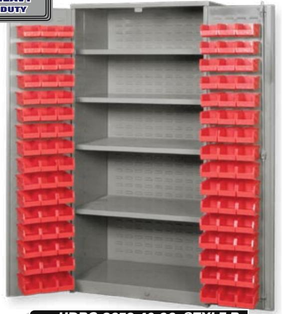
HDHC-3672-40-96 STYLE B