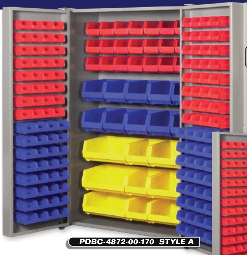
PDBC-4872-00-170 STYLE A