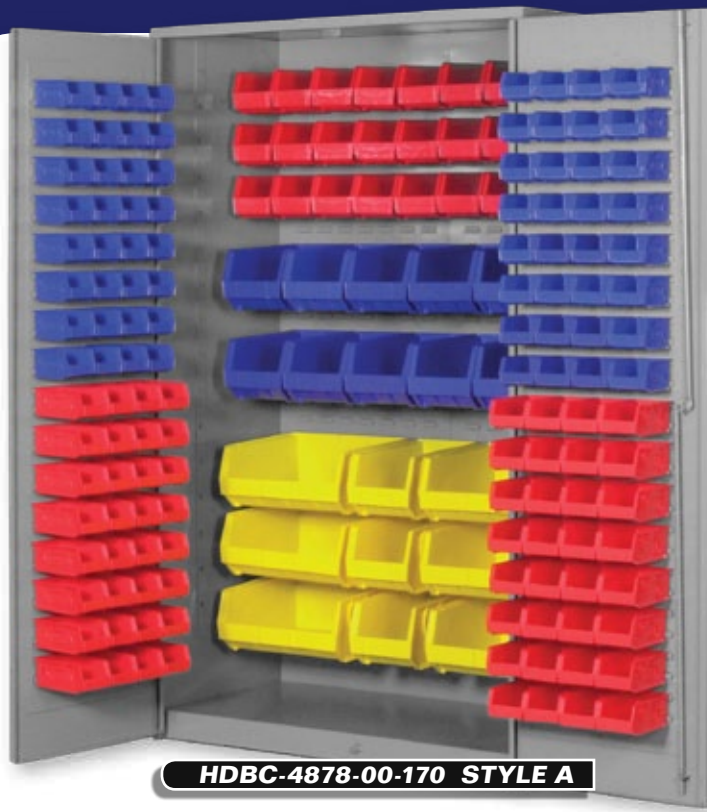
HDHC-4878-00-170 STYLE A